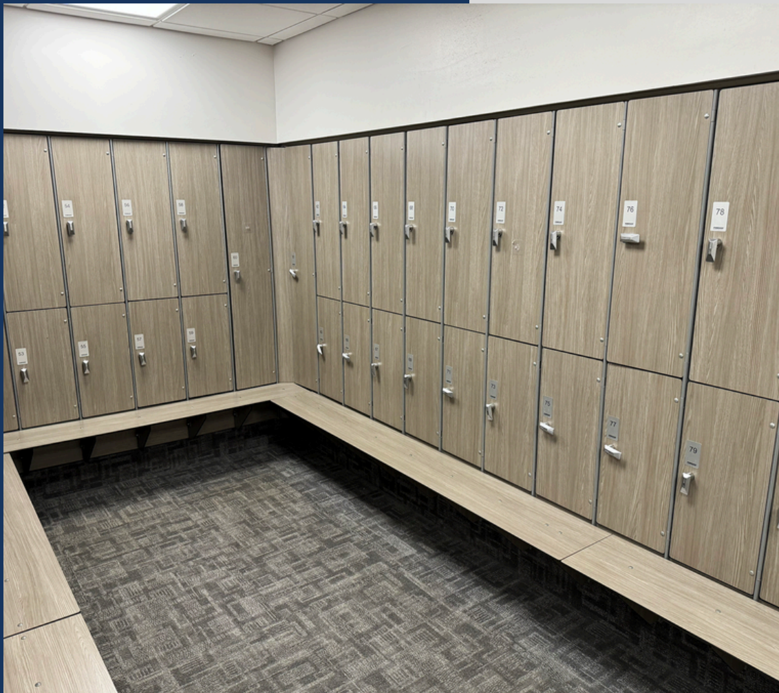
ITLAIAN CENTER OF STAMFOR | SIGNATURE WITH INTEGRATED BENCH