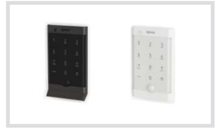
OJMAR OCS Pro