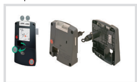
SAG Safe-O-Mat 800 Coin Lock